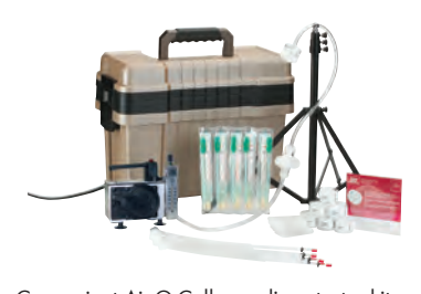
Convenient Air-O-Cell sampling starter kits include a sampling pump, sampling stand, tubing, carrying case and a supply of various sampling media.